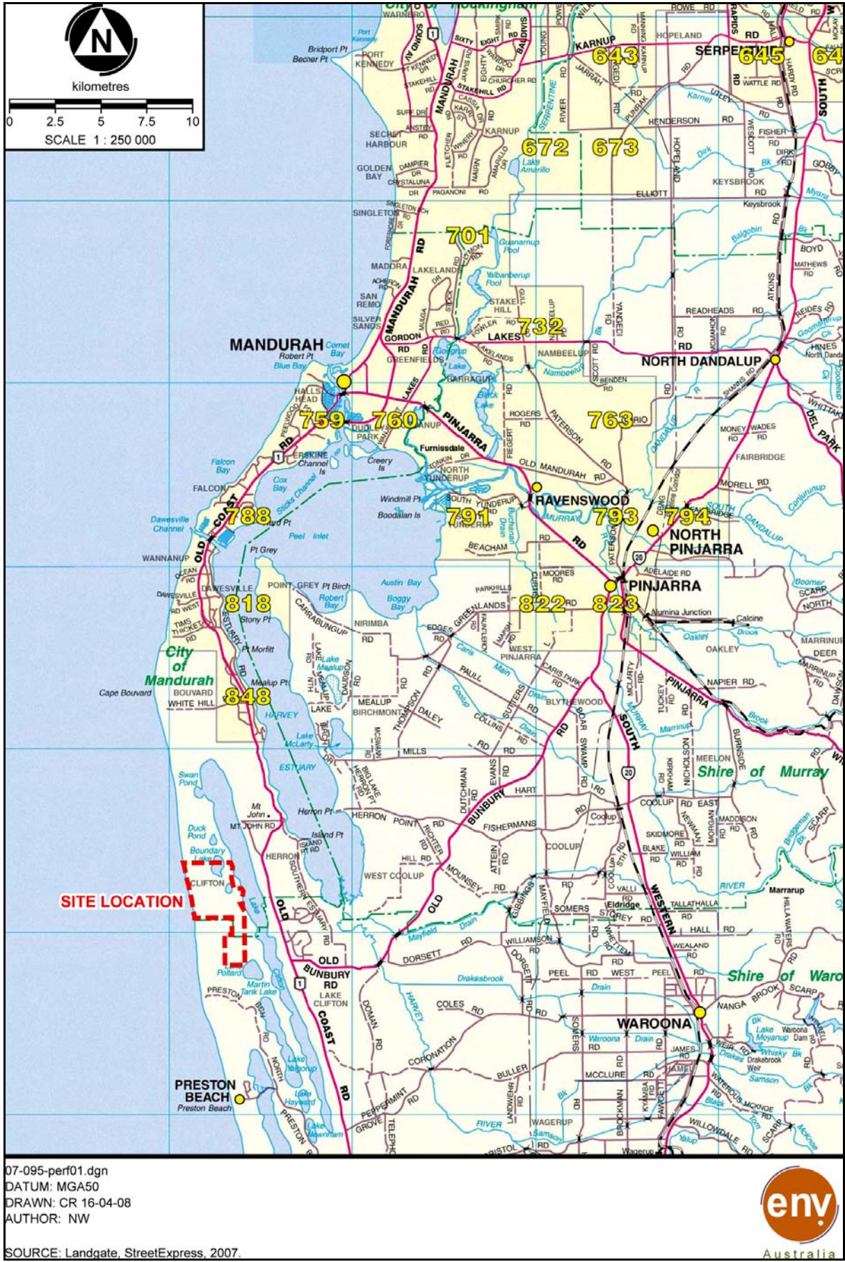
Figure 1: Regional location of the proposal site